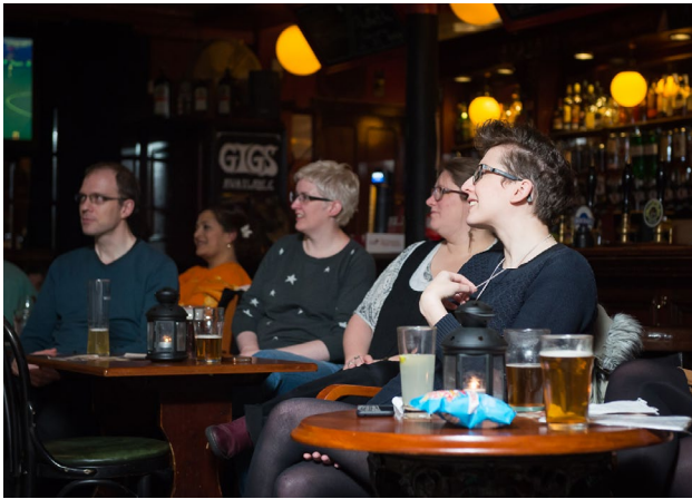
The 'Gone but Not Forgotten' event was an evening of poetry and storytelling at the Blind Poet pub in Edinburgh. © Cameron Fraser.