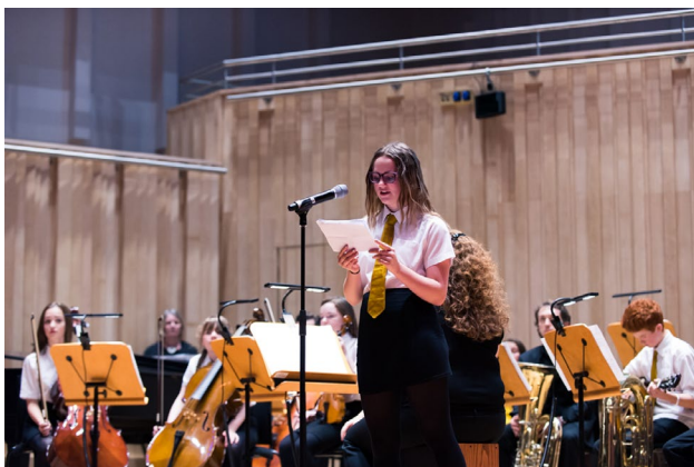
Girl reading aloud at a Music of Memories event.

Musicians from the orchestra worked with schoolchildren from five areas across Scotland. The schoolchildren met elderly local residents to discuss their ‘absent friends’, and, inspired by those meetings, wrote words and music to capture feelings and memories. The music was performed in the RSNO centre at the Glasgow Royal Concert Hall by the children themselves, alongside professional musicians, interspersed with video clips of the older people talking.