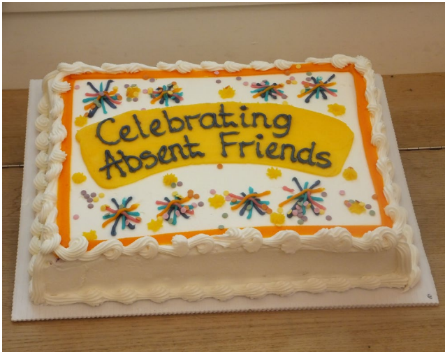
Cake baked as part of Volunteer Midlothian Community Links Dementia project's celebration of To Absent Friends .

are more common among people who are widowed. The Children's Hospice Association Scotland and The Compassionate Friends UK have both made moving films about the difficulties parents who have experienced the death of a child face because people do not know how to act around them. 2