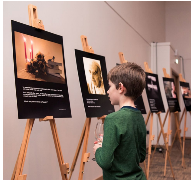
Boy looking at winning entries from the Essence of a Memory photography competition.

Different types of ‘ To Absent Friends supper’ have taken place – from the intimate and private to the public and formal. Feedback from participants indicate that each one